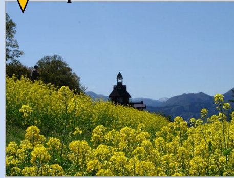
4 Nanohana Park Rapeseed Flowers