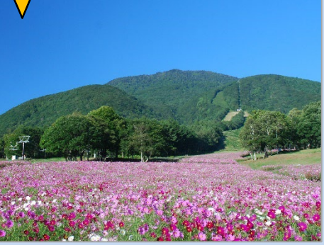
10 Kurohime Kogen Cosmos