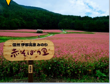
11 Shinshu Ina Kogen Red Soba