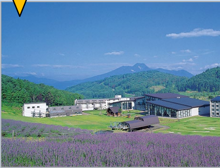
7 Hotel Tangram Lavender