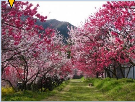
2 Hanamomo no Sato Peach Blossoms