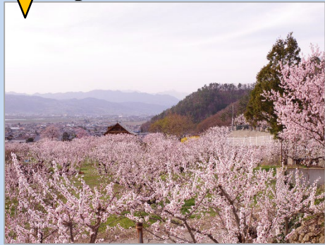
1 Anzu no Sato Apricot Blossoms