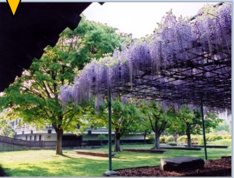
6 Shinano Kokubunji Wisteria