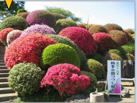
5 Tsurumine Park Azaleas