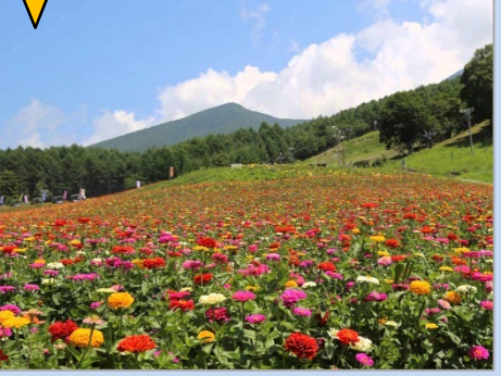
9 Fujimi Kogen Resort Zinnia