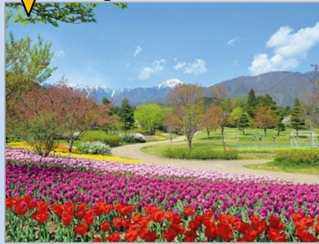
3 Alps Azumino Park Tulips