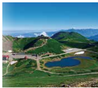
Mt. Norikura Tatamidaira